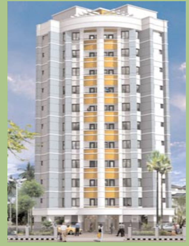
Sreerosh Residency EAST HILL ROAD - CALICUT