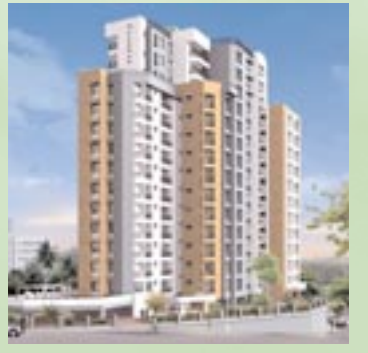
Sreerosh Sreepadmam THALAP - KANNUR