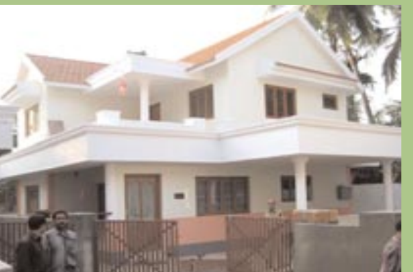
Sreerosh Avenue - Independent Villas Edachovva - Kannur