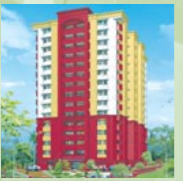
Sreerosh Seascape NEAR COURT - THALASSERY