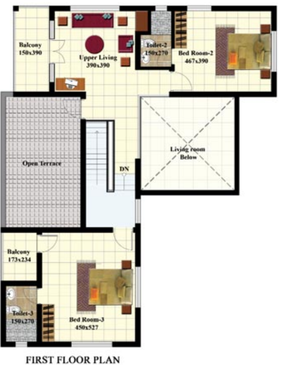
Type A1 Balcony 150x390 150x390 Kitchen Bcd Room-4 360x467 240x450 368x150 173x234 TYPE - A1 AREA STATEMENT Ground Floor area : 1700.00 sq.ft : 1436.00 sq.ft First Floor area Total Area : 3136.00 sq.ft