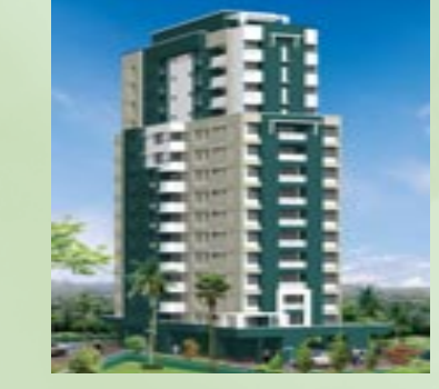
Sreerosh Emerald Heights PAYYAMBALAM - KANNUR