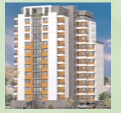
Sreerosh Bay Heights PAYYAMBALAM - KANNUR